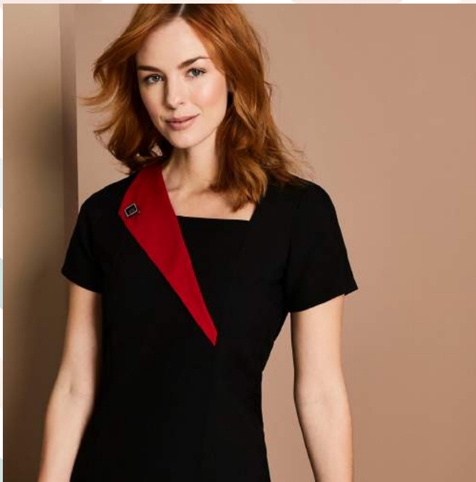
Contrast Lapel Tunic, Black with Red