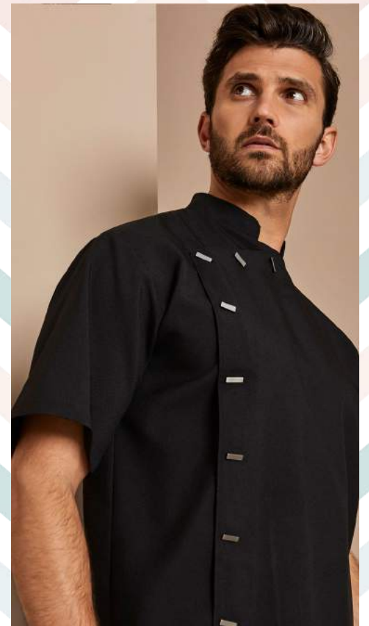
Men's Asymmetrical Tunic, Black