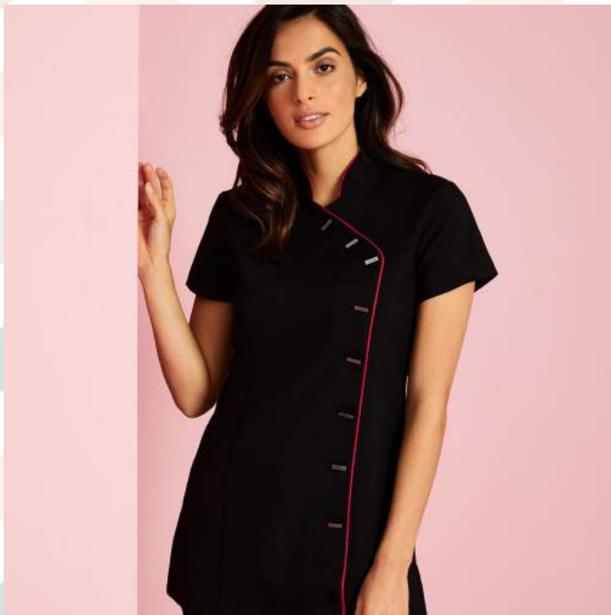
Asymmetrical Tunic, Black with Hot Pink Trim