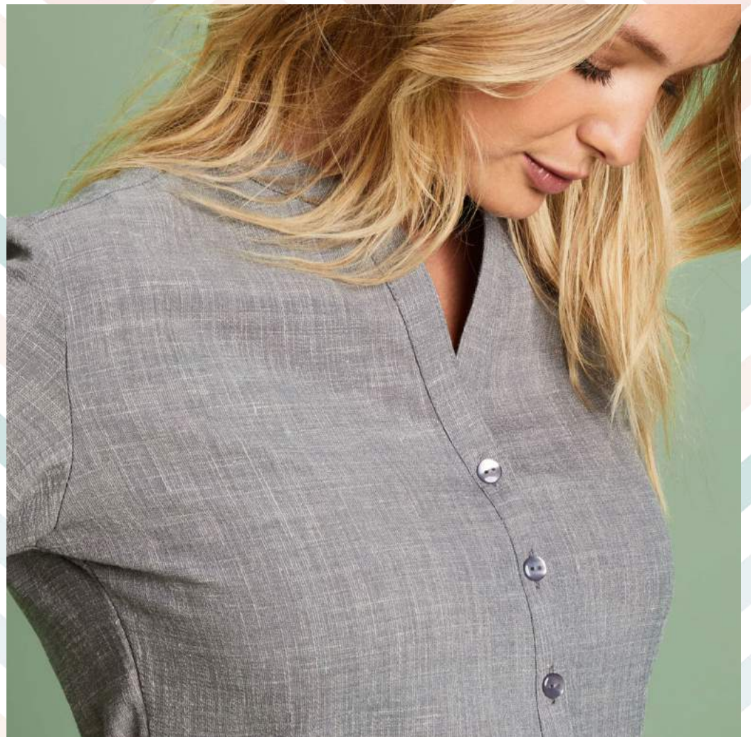
Linen Blend Button Front Tunic, Grey