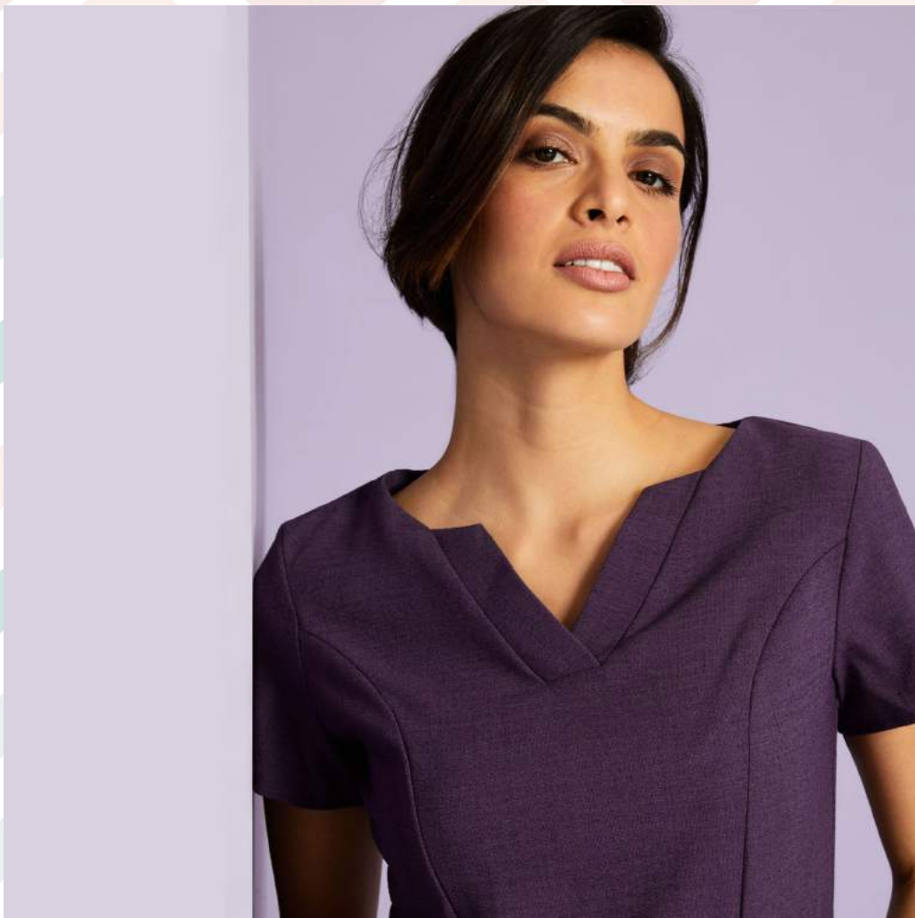
Linen blend V-neck Tunic, Plum