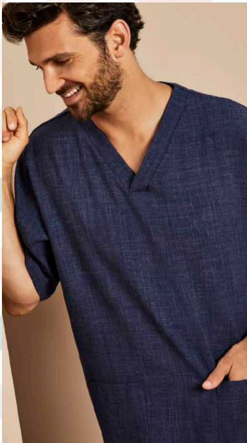
Linen Blend Men's V-neck Tunic, Navy