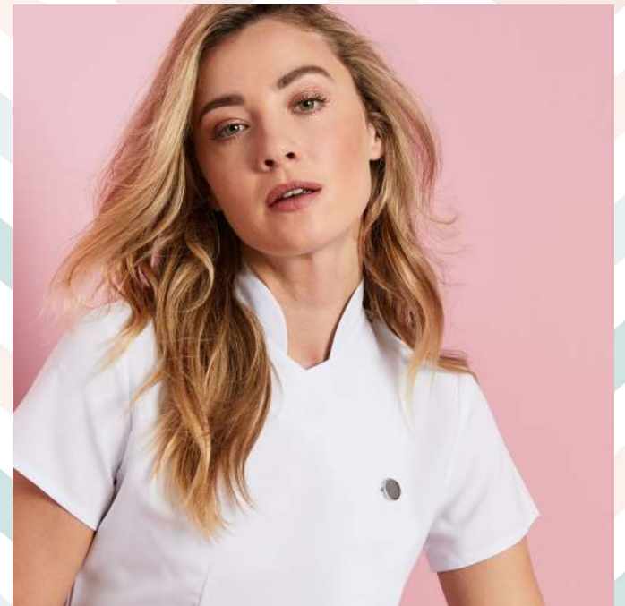
One Button Tunic, White