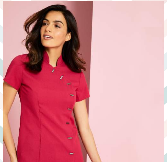
Asymmetrical Tunic, Hot Pink