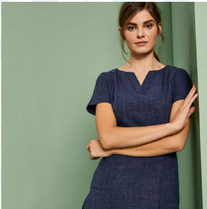
Linen blend V-neck Tunic, Blue