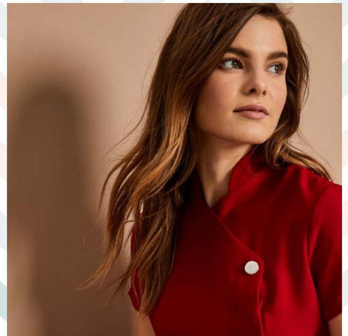
One Button Tunic, Red