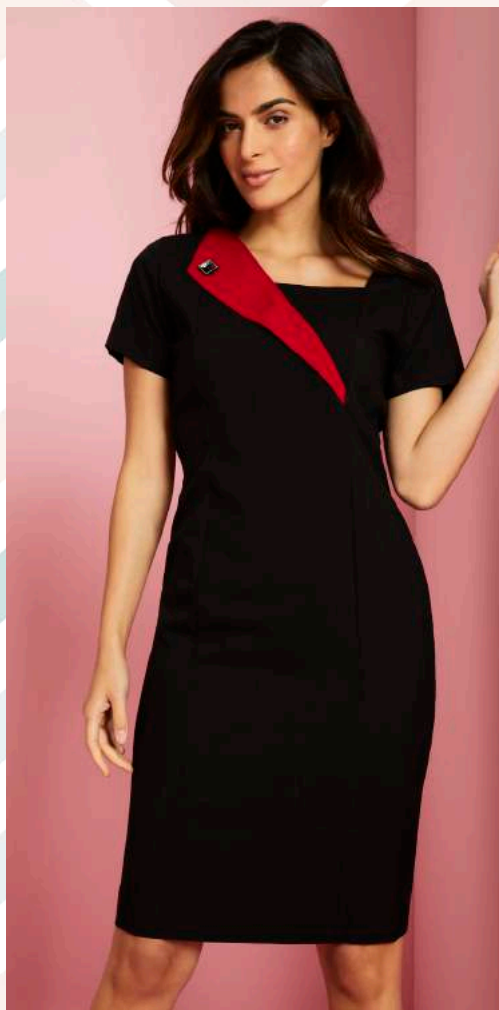
Lapel Dress, Red