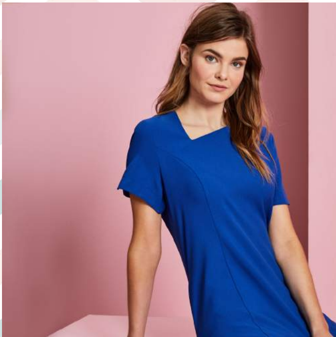
Scooped Angle Neckline Tunic, Cobalt Blue