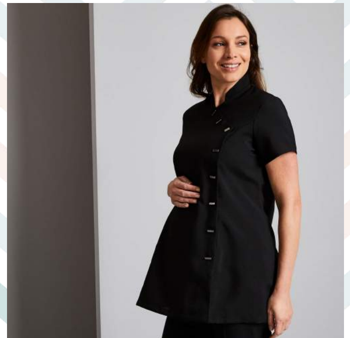
Asymmetrical Maternity Tunic, Black