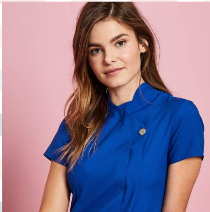
One Button Tunic, Cobalt Blue