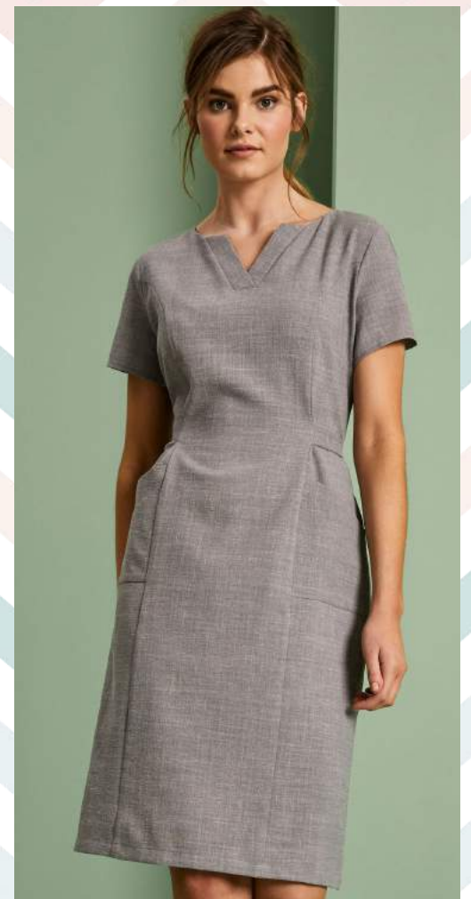
Linen Blend V-neck Dress, Grey