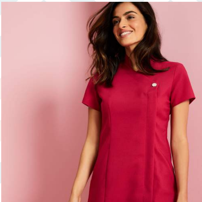
One Button Tunic, Hot Pink