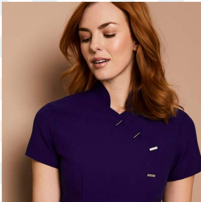
Asymmetrical Tunic, Royal Purple