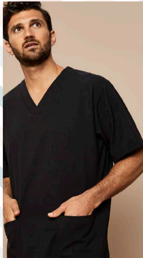
Linen Blend Men's V-neck Tunic, Black