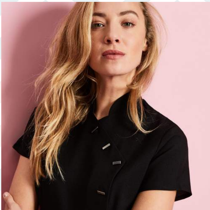
Asymmetrical Tunic, Black