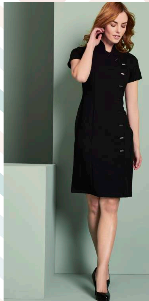
Asymmetrical Dress, Black