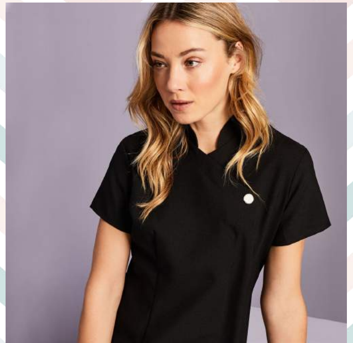
One Button Tunic, Black