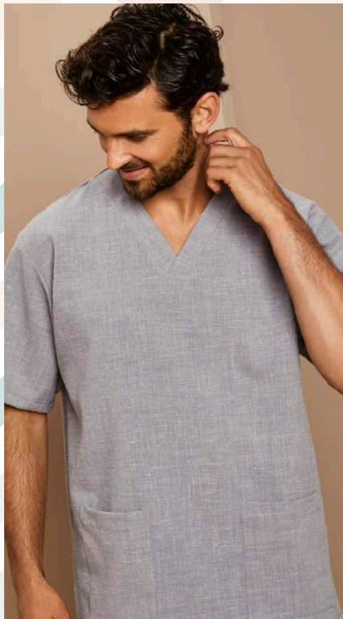
Linen Blend Men's V-neck Tunic, Grey