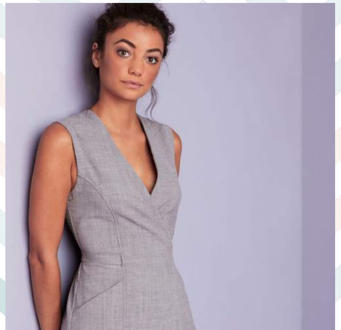
Linen Blend Wrap Tunic, Grey