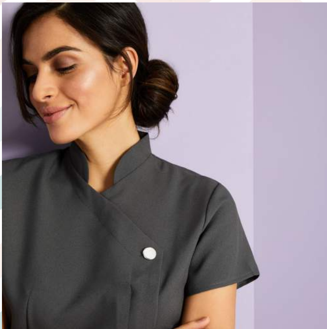
One Button Tunic, Graphite